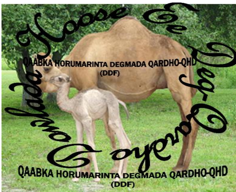
Figure 1 (Gardo Logo)