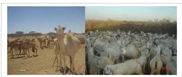
Average sustainability of a business

The most important sources of income include animal products, business, remittances from the Diaspora and a limited donor funds.