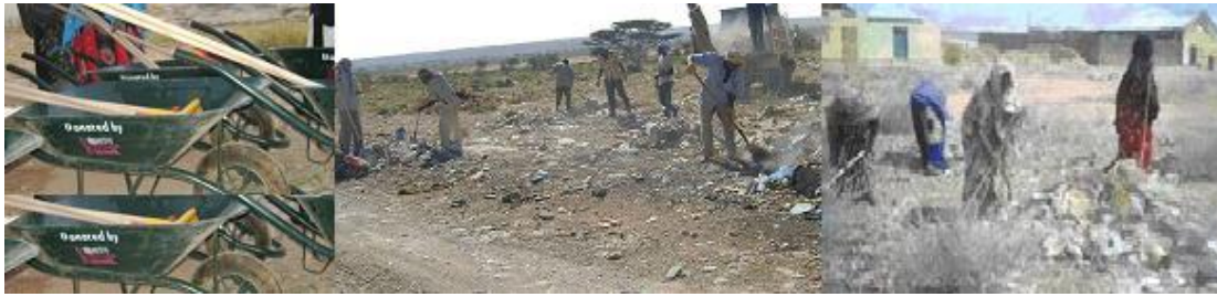
Figure 5 Sanitation and garbage collection campaign