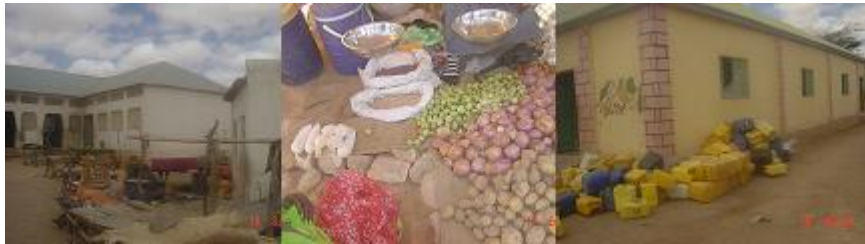
Figure 4 Vegetables, fruits and meat market