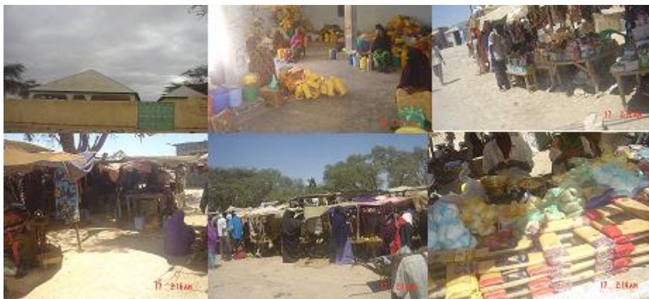
Figure 3 The current largest market place