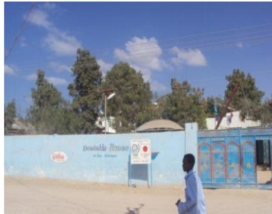
Front view of Bosasso Municipality