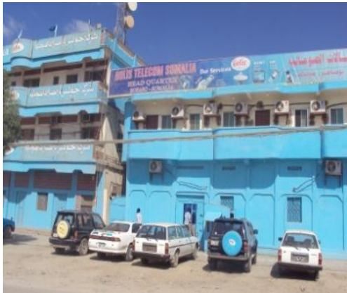
Golis Telecommunications in Bosasso