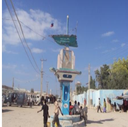
Bosasso Local Government Statute